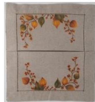
16 – Bittersweet & Chinese Lanterns Tablerunner Colored Pencils – 45”x16” – Beg/Int – 6 hr $44 Robin Pohlman Saturday 9:00AM – 4:00 PM