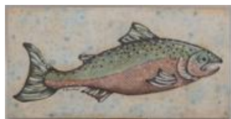
17 – Salmon of Legend Acrylic and Graphite Pencil 12”x6”x1.5” – Beg – 4 hr $40 Barbara Boardman Sunday 9:00AM–1:00pm