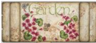
05 – Garden Mixed Media 18”x7.5”–Int – 6 hr $38.50 Viki Sherman Friday 9:00AM – 4:00 PM