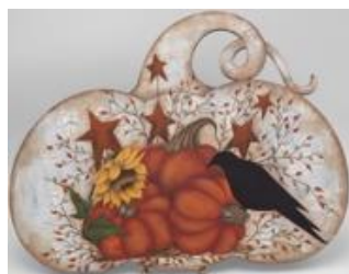
13 – Autumn Stars Acrylic – 16”x12” Int – 6 hr $42.50 Viki Sherman Saturday 9:00AM – 4:00PM