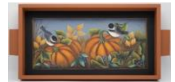
08 – Pumpkins and Chickadees Acrylic – 18x9”– Int – 6 hr $56 Diane Crean, CDA, CZT Friday 9:00AM – 4:00 PM