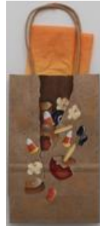
03 – Halloween Candy Bag Acrylic on paper Int– 8.75”x5.25” $12 Ann Davis Thurs 7:30 – 9:30 PM