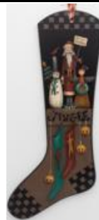
11 – Hang Your Stocking Acrylic–7”x16.5”– Int $43 Debbie Reeder 4 hr Friday 6:00 – 10:00 PM