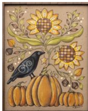
15 – Pumpkinberry Thicket Acrylic and Colored Pencil – 10”x8” – Int – 6 hr $38 Barbara Boardman Saturday 9:00AM – 4:00 PM