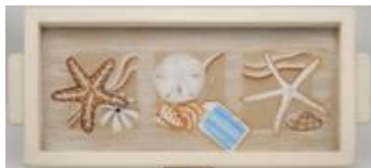
14 – Shell Tray Acrylic – 18x9”x2” – Int – 6 hr $56 Diane Crean, CDA,CZT Saturday 9:00AM – 4:00 PM