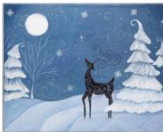
09 – Frosty Rudolph Acrylic – 16x20” – Int $33 Ann Davis 4 hr Friday 6:00 – 10:00 PM