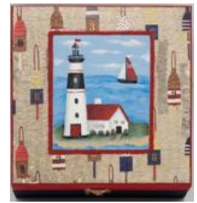
04 – Lighthouse Box Acrylic –Beg/Int 6.5”x6.5”x2.75” $21 Kathy Denneler Thurs 7:30 – 9:30 PM