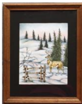
13 – Night Watch Oil Rouging – 14x11” – Beg $50 Kathy Myrick 4 hr Sunday 9:00 – 1:00 PM