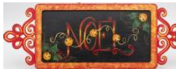
10 – Christmas Noel Traditions – 14”x5” – Int $35 Robin Pohlman 4 hr Friday 6:00 – 10:00 PM