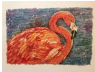
07 – Florence the Flamingo Watercolor Batik – 15”x11” Int – 6 hr $40 Alice Dudley Friday 9:00AM – 4:00 PM