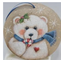
01 – Christmas Bear Ornament Acrylic-Int-4.5" dia $17 Peg Altemus Thurs 7:30 – 9:30 PM