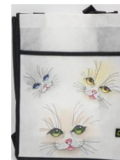
03 – Cat's Eyes Tote Pen & Fabric Paint Beg – 12"x9"x4" $12 Ann Davis Thurs 7:30 – 9:30 PM