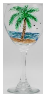
04 – Beach Glass Oil based markers – Beginner – 8.5" $39 Kathy Anthony Thurs 7:30 – 9:30 PM