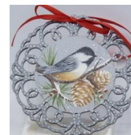
02 – Snowy Chickadee Ornament Acrylic-Int -5" dia $17 Debbie Reeder Thurs 7:30 – 9:30 PM