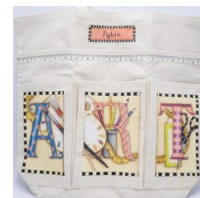
06 – Artful Journey Canvas Bag Acrylic – 18x16"- Int 6 hr $45 Robin Pohlman Friday 9:00 – 4:00 PM